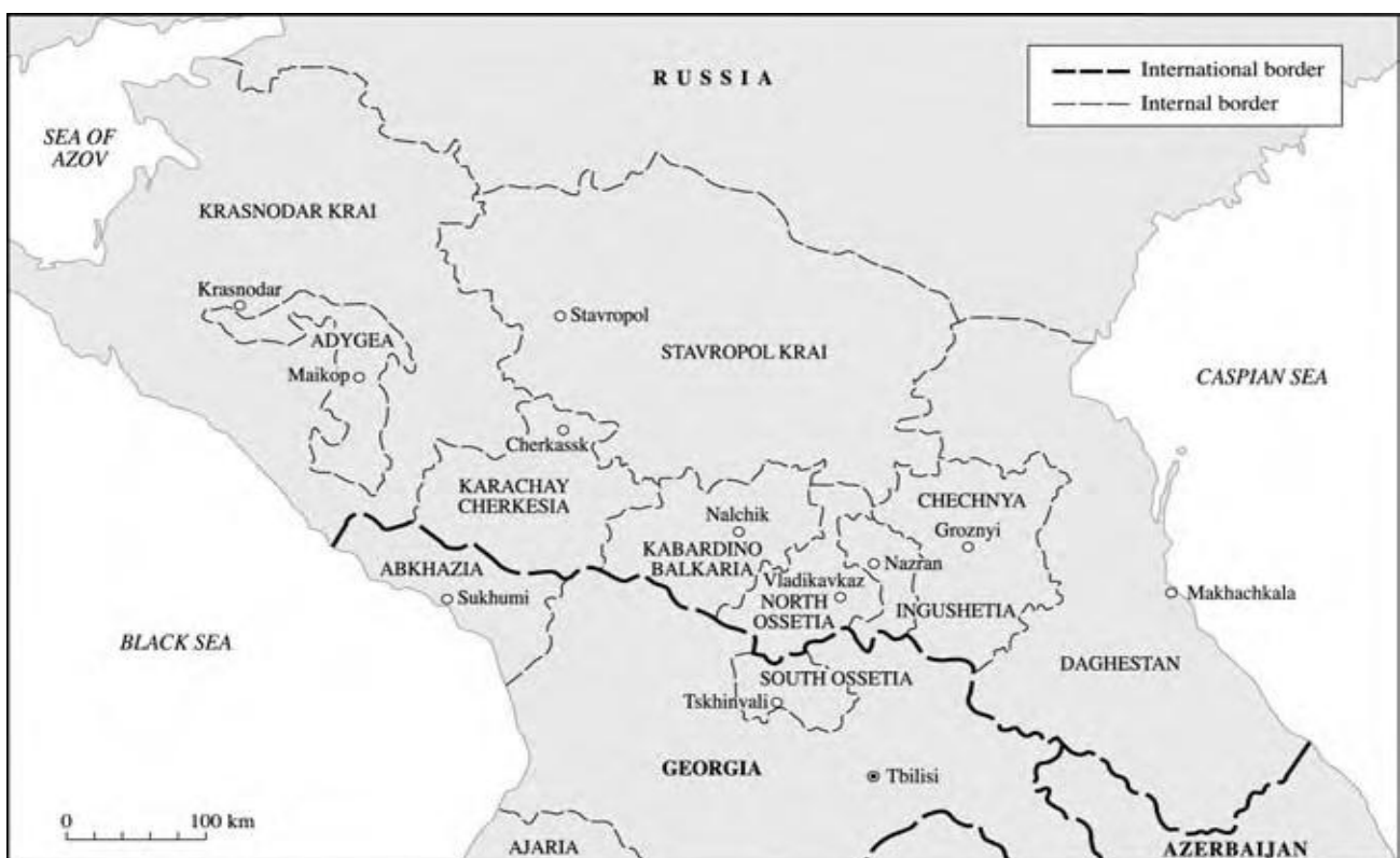
Map 1. The administrative division of the North Caucasus.

Keywords: North Caucasus; Kabardino-Balkaria; basic natural state; Islam; institutionalization.